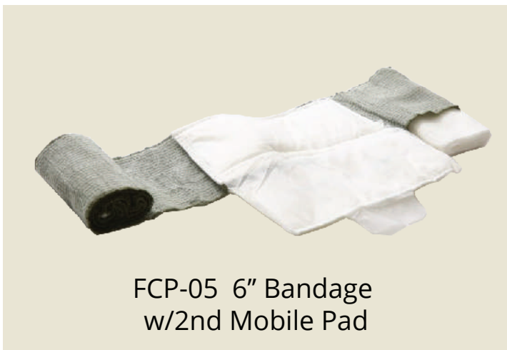
FCP-05 6" Bandage w/2nd Mobile Pad