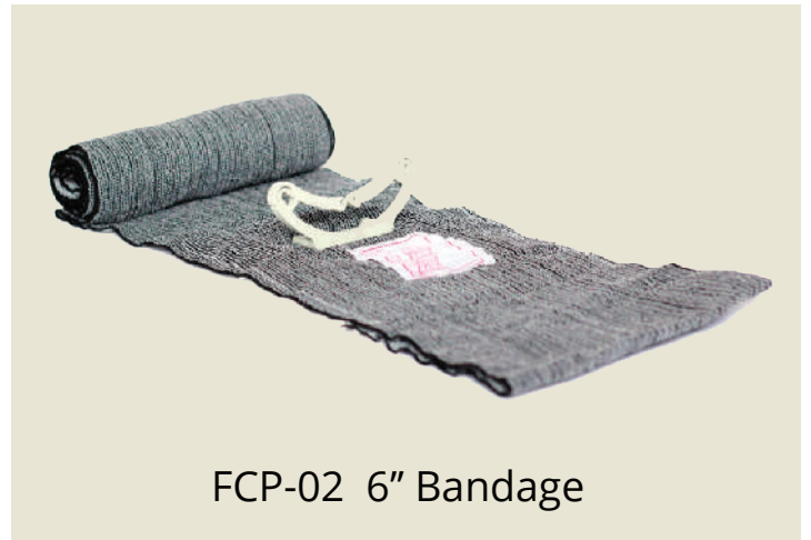
FCP-02 6" Bandage