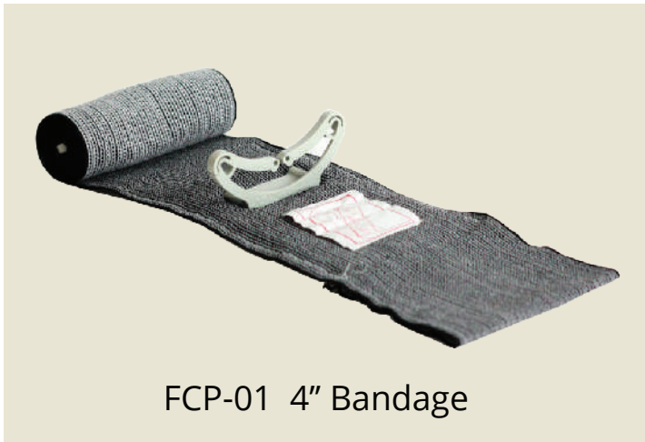
FCP-01 4" Bandage