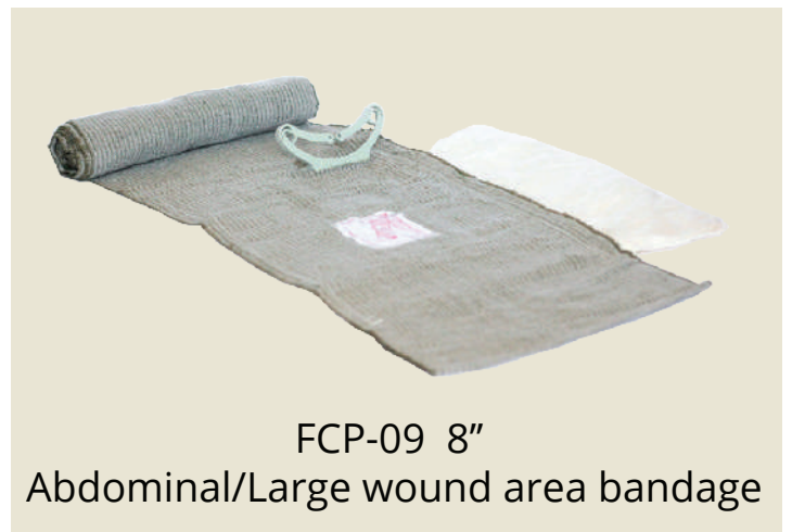
FCP-09 8" Abdominal/Large wound area bandage