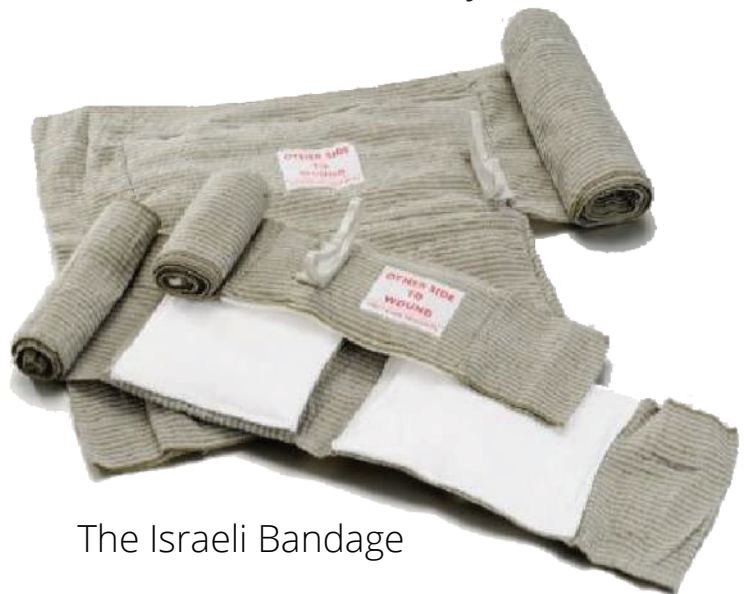
The Israeli Bandage

Persys Israeli Bandage 6 Inches With Additional pad